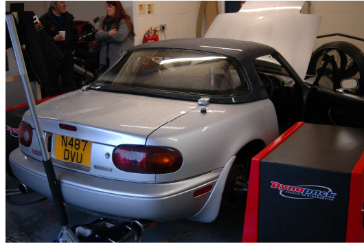
Stuart MacMaster – Mazda MX-5 – 1.8 – 101.3bhp & 97.3 ft/lb @ Wheels