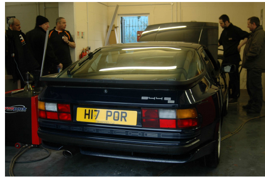
Alan Smith – Porsche 944 S2 – 3.0 – 170bhp & 178.3 ft/lb @ Wheels