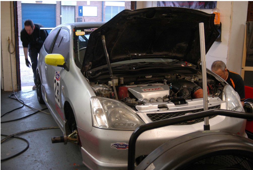
Dave Hill – Honda Civic EP3 Type R – 2.0 – 188bhp & 139 ft/lb @ Wheels