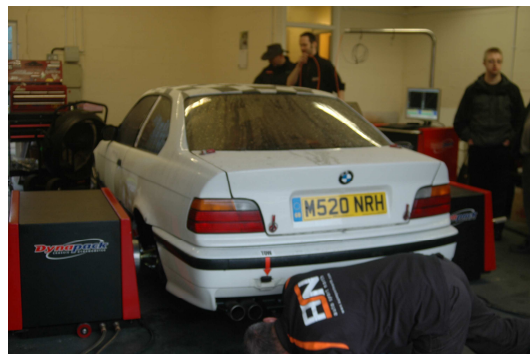
Andy Davies – E36 BMW M3 – 3.0 – 283.9bhp & 235.7 ft/lb @ Wheels