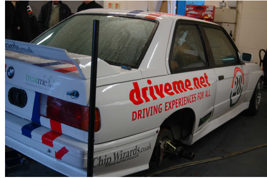
Allan Davies – E30 BMW M3 – 2.5 – 251.3bhp & 176.4 ft/lb @ Wheels