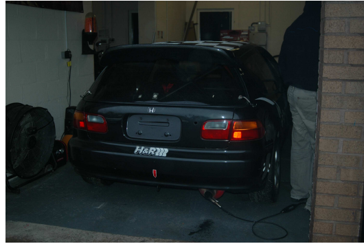
Carl Bennett – Honda Civic EG6 – 1.6 – 135.1bhp & 95 ft/lb @ Wheels